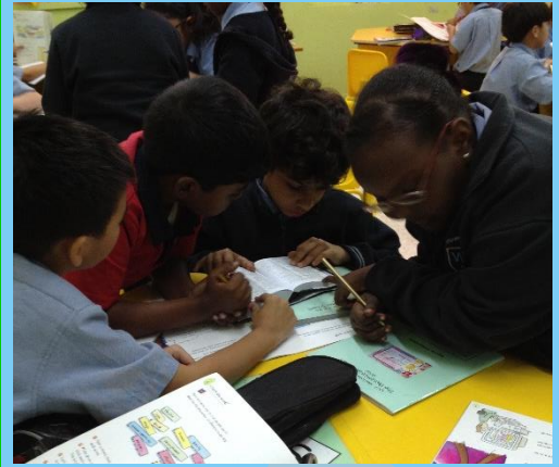
Using a dictionary to find the meaning of different words describing the properties of materials.

Science: We are learning about different uses and properties of materials. We investigated about different papers and their properties. How different papers are used for many different uses.