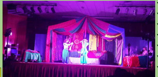
Some good work by us